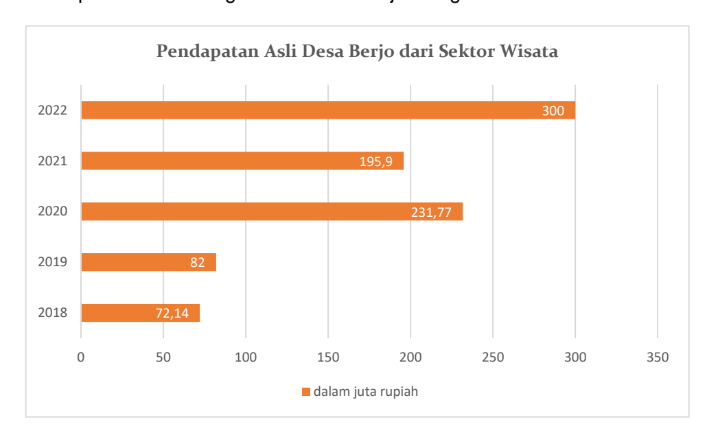
Diagram 4. Total Income of Berjo Village from the Tourism Sector

The large number of tourist visits to Berjo Village certainly has a positive impact on village income. The amount of income earned each year makes Berjo Village BUMDes the richest BUMDes in Karanganyar Regency (Mashuri, 2021). Even in 2020 during the pandemic and the tourism sector was dimming, Berjo Village BUMDes earned revenue of 3.4 billion. It is said that outside of the pandemic, revenue can reach 4.5 billion just from the two tourist attractions, Jumog Waterfall and Madirda Lake. Of course, not all income from tourism goes into the village treasury. Revenue from the tourism sector will be divided into three parts, namely 30 percent goes to the tourism agency, 30 percent goes to the village treasury (PAD), and 40 percent goes to the BUMDes cash for maintenance and repair of tourist infrastructure as well as employee salaries. From the income earned, every year BUMDes can contribute tens to hundreds of millions of rupiah PAD to the government of Berjo Village.