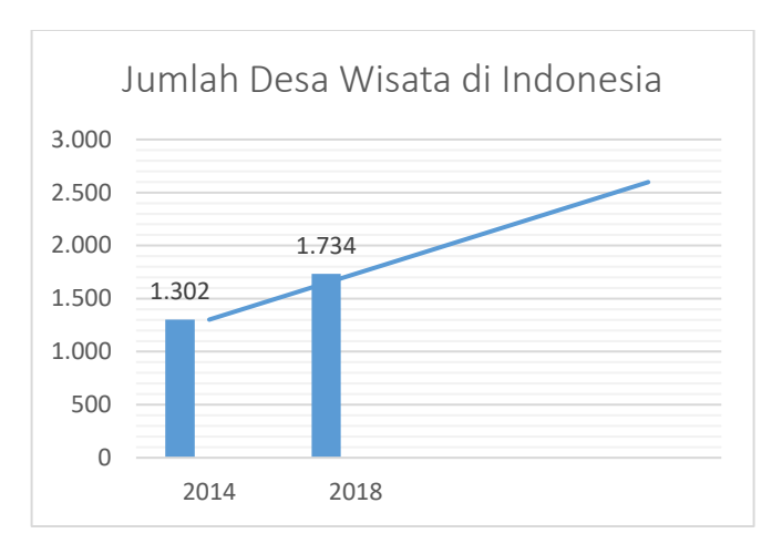
Diagram 1. Number of Tourism Villages in Indonesia